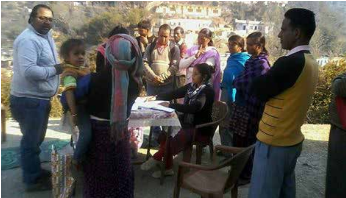
Digital Literacy Certificate Distribution at Narender Nagar soochna Seva Kendra