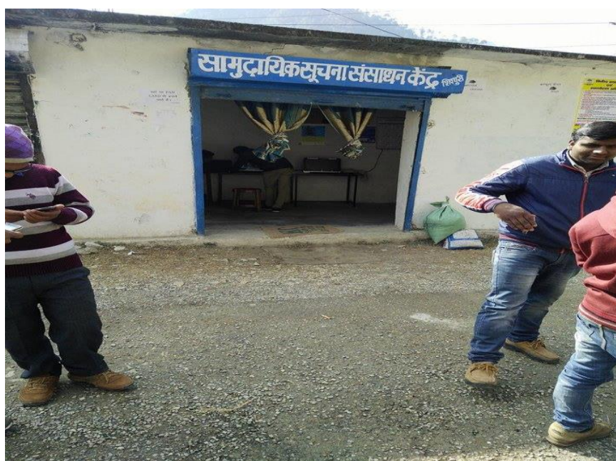
Figure 2- SSK Shivapuri