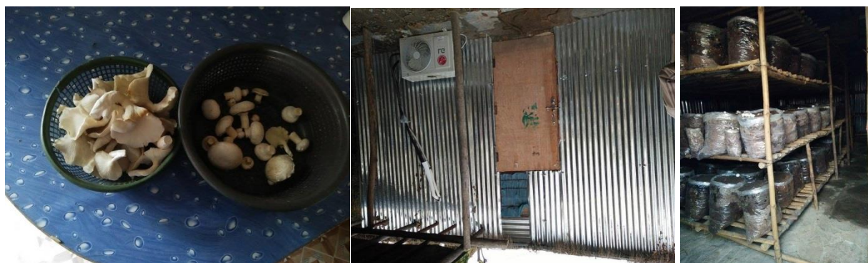
Figure: Fresh Mushroom

Mushroom Cultivation- Provide a training for mushroom cultivation which is comfortable and sustainable livelihood and income generation option. Mushroom cultivation does not require a labor intensive; it's requiring minimal physical, financial inputs, resources and can be easily start from the small place which could be home. Mushrooms are best cultivated indoors in a dark, cool and sterilized and enclosed building. Mushrooms are suitable to grow vastly and quickly. The most common edible mushrooms are white button, oyster. To supporting this plan we visited mushroom plant near Chamba block. We have met firm owner Mr. Devendra and requested him for lead a training program, he agreed and start the training in 2 nd week of February 2017.