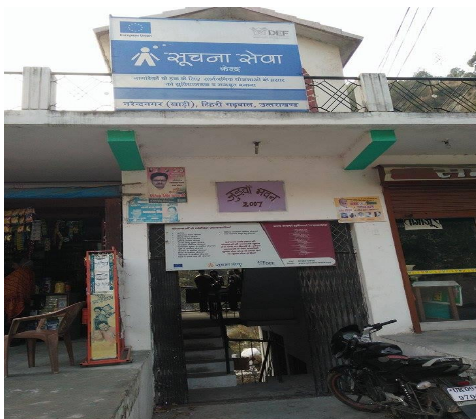
Figure 1- SSK Narendranagar Block