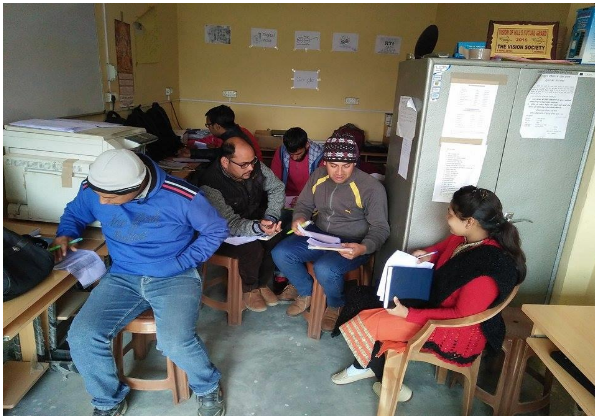
Staffs are discussing their work progress

THDC CSR- the proposal has been submitted to THDC for seeking financial support to provide access to information on public schemes and delivery of government entitlement to the community.